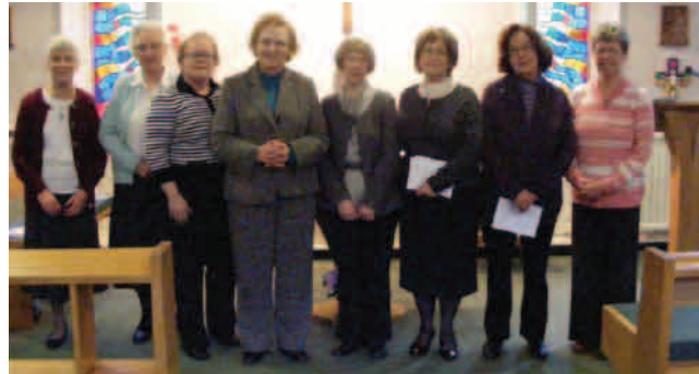
Top: Associates at commitment ceremony in the UK.

Once I had made my commitment as an Associate I felt a real sense of joy at being part of the community. That joy has never left me. I love the vibrant, uplifting and meaningful liturgies we celebrate, and which have been prepared with such care. They truly are the work of the