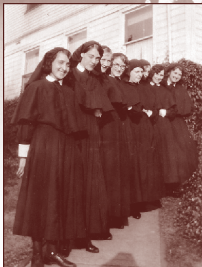
Novices circa 1920