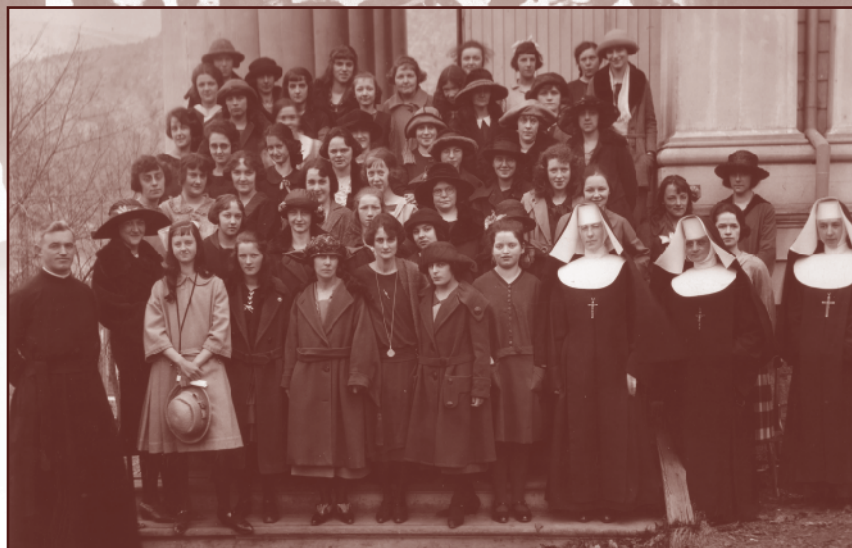
St. Joseph Academy, 1923